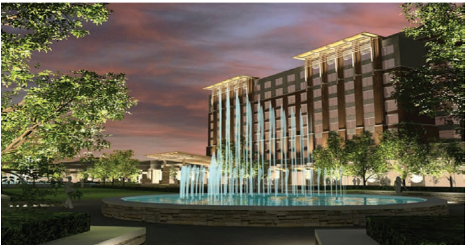
Sheraton Flowood The Refuge Hotel & Conference Center 2200 Refuge Boulevard • Flowood, MS • 39232